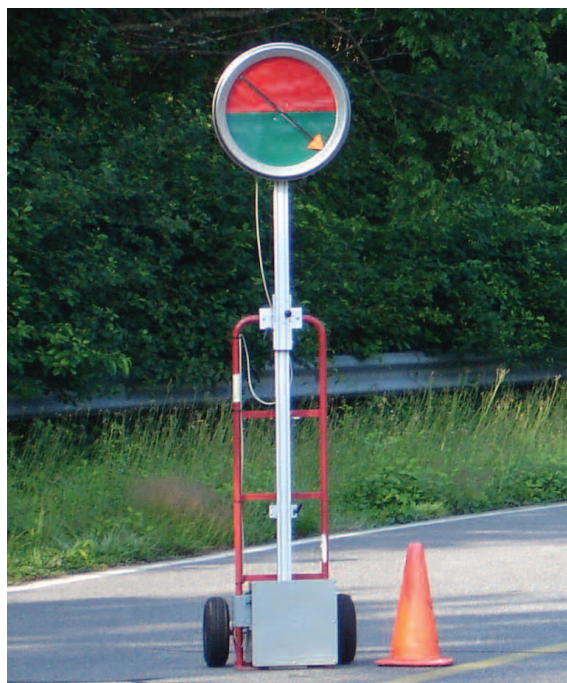
Photo 1: One of five pace clocks positioned around the test track. The bottom half of each pace clock face was green and the top half was red. An arrow hand moved around the pace clock at a constant rate and drivers were told to pass by the pace clock when the arrow was in the green portion of the clock face.

clock at a constant rate and drivers were told to pass by the pace clock when the arrow was in the green portion of the clock face. Additionally, drivers could not come to a complete stop when approaching a pace clock nor exceed 30 miles per hour. Researchers recorded the percentage of pace clocks that were passed correctly for each drive.